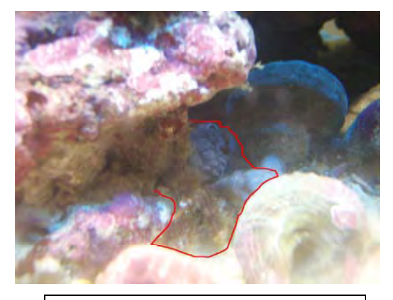
Big Black N' Ugly (top)

They do add calcium on occasion but it's not on a routine or schedule. Other than that – no additives.