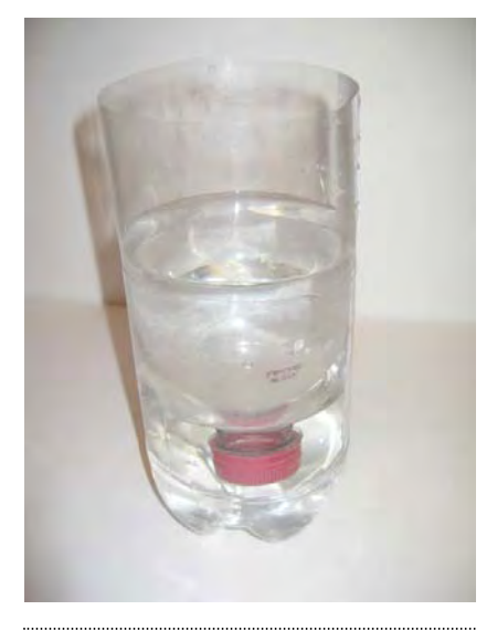
2 liter bottle, bottom half filled with hot tap water and top half inverted and filled with tank water.

Step 4: Add Eggs. Add about 1/8 - 1/4 tsp. of decapsulated eggs to the water. These can be either purchased or you can decapsulate them yourself.